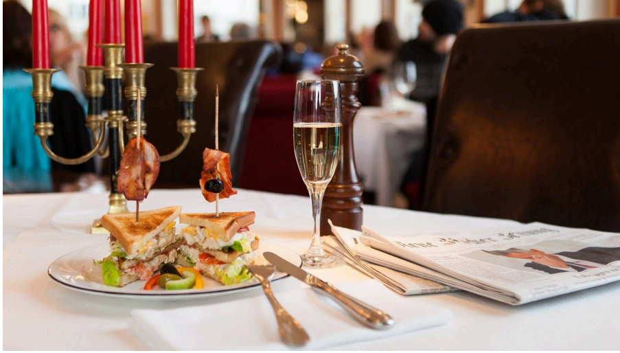
Café de Ville