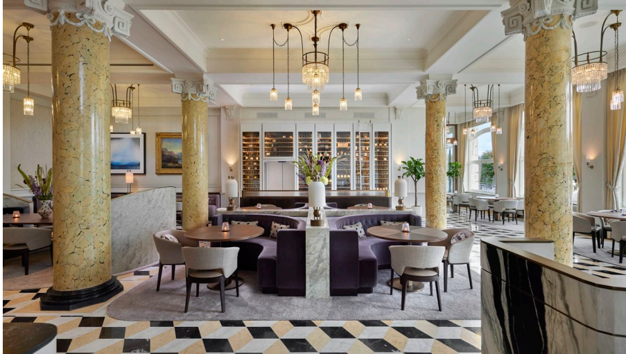
Colonnade - © George Apostolidis