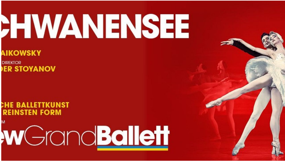
Kiev Grand Ballett - Schwanensee