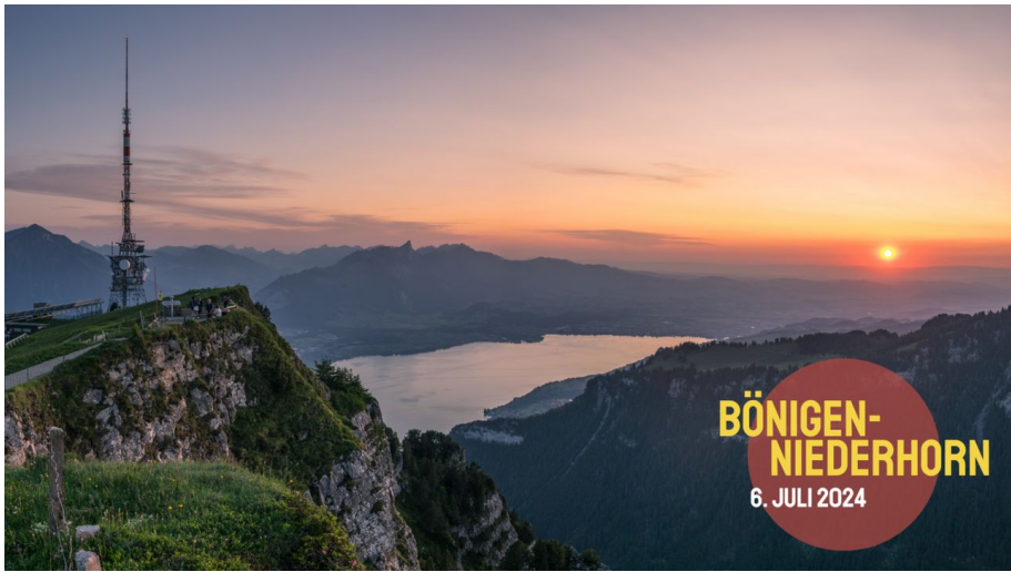
VSZB 23 Website 1536x864