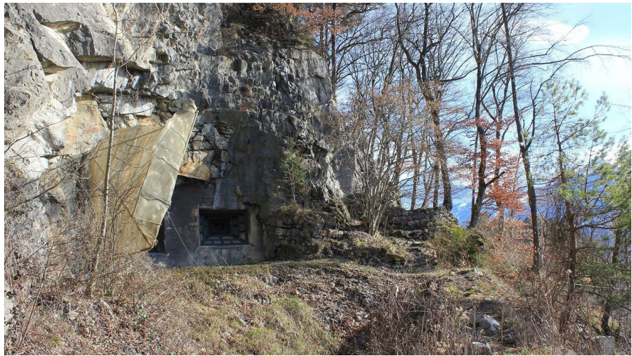
Bunker Fischbalmen