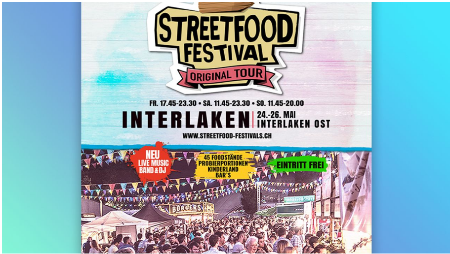
Streetfood Festival – Interlaken Ost

Festival, Festivities Gastronomy Concerts