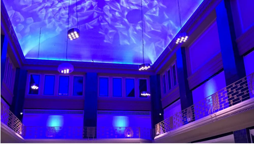
Restaurant KWB im Stadtpalais - © HOSTA Hotelmanagement GmbH