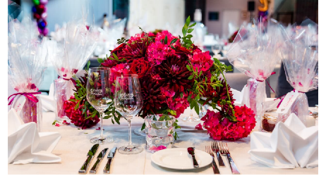
Restaurant KWB im Stadtpalais