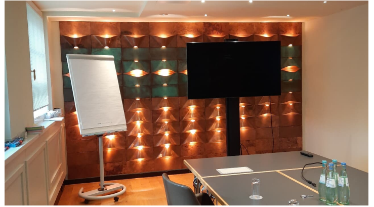
Tagungsraum Kalk