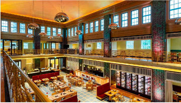
Restaurant KWB im Stadtpalais