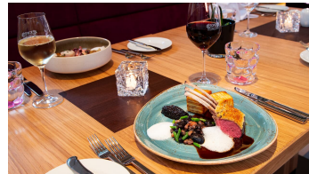
Restaurant KWB im Stadtpalais