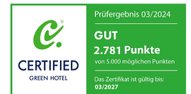
Certified Green Hotel