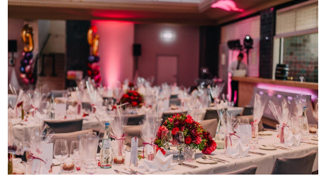
Restaurant KWB im Stadtpalais