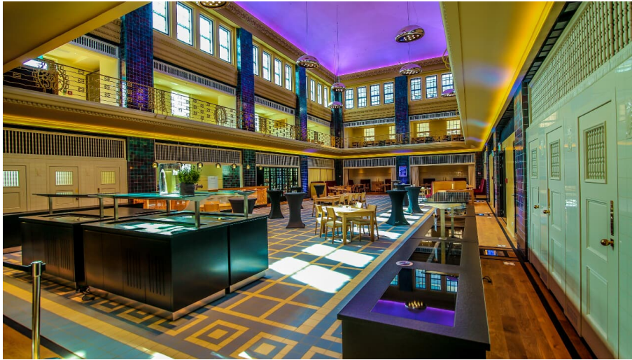
Restaurant KWB im Stadtpalais