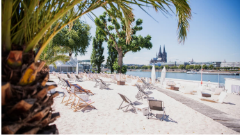
km 689 Cologne Beach Club, Liegebereich mit Domblick