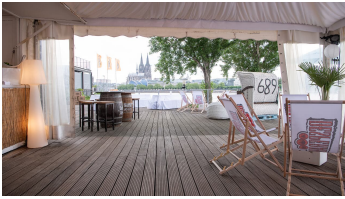
km 689 Cologne Beach Club, DomBlick Lounge