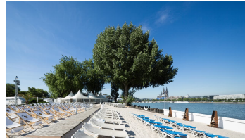
km 689 Cologne Beach Club, Liegebereich mit Domblick