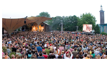
Tanzbrunnen, Open-Air-Konzert