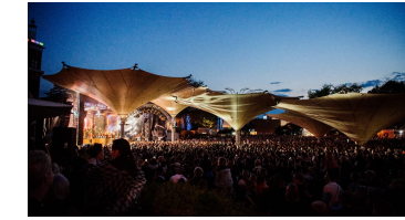
Tanzbrunnen Köln, Open-Air-Konzert