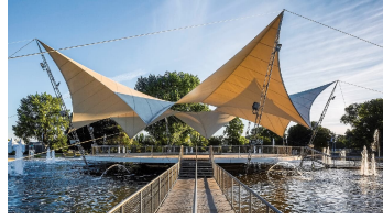
Tanzbrunnen Köln, Brunnen