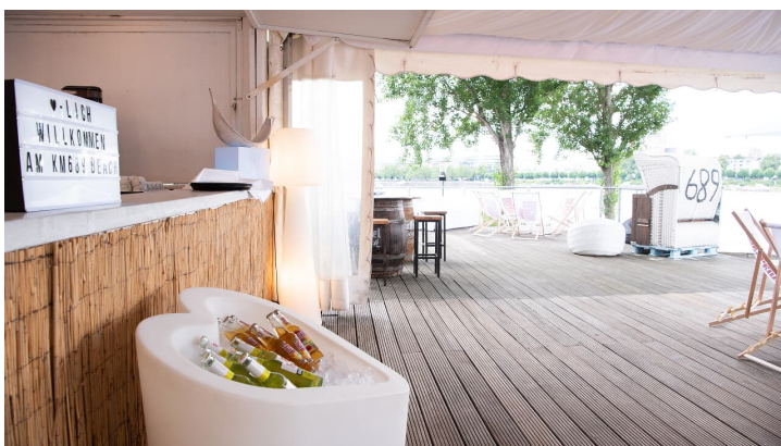
km 689 Cologne Beach Club, DomBlick Lounge