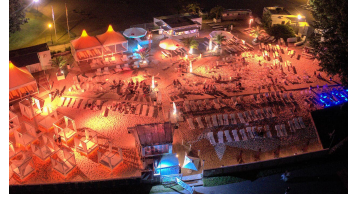
km 689 Cologne Beach Club, Liegebereiche, Abendstimmung