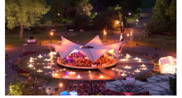
Tanzbrunnen Köln, Brunnen illuminiert, Open-Air