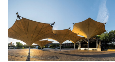
Tanzbrunnen Köln