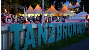
km 689 Cologne Beach Club, am Tanzbrunnen