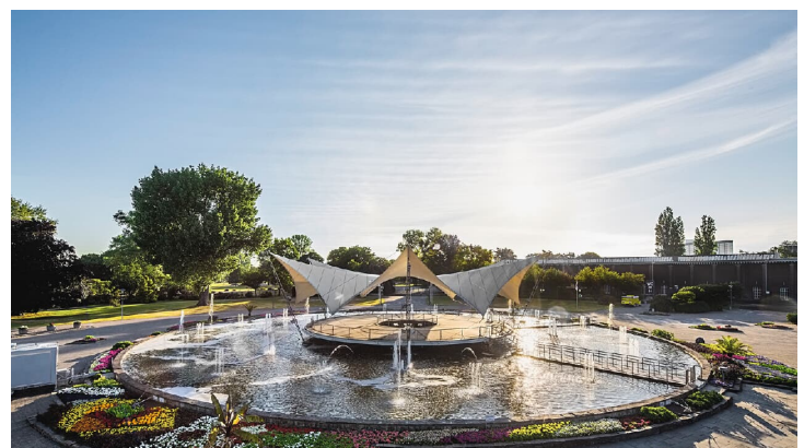
Tanzbrunnen Köln, Brunnen