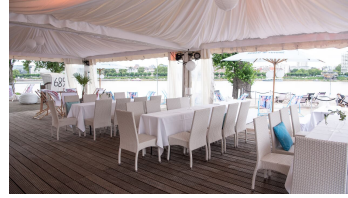
km 689 Cologne Beach Club, DomBlick Lounge