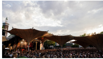
Tanzbrunnen Köln, Open-Air-Konzert