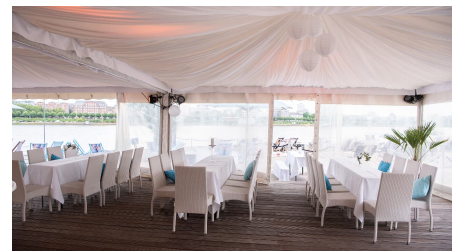
km 689 Cologne Beach Club, DomBlick Lounge