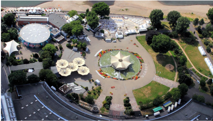
Tanzbrunnen Köln mit Rheinterrassen und km 689 Cologne Beach Club, Luftaufnahme