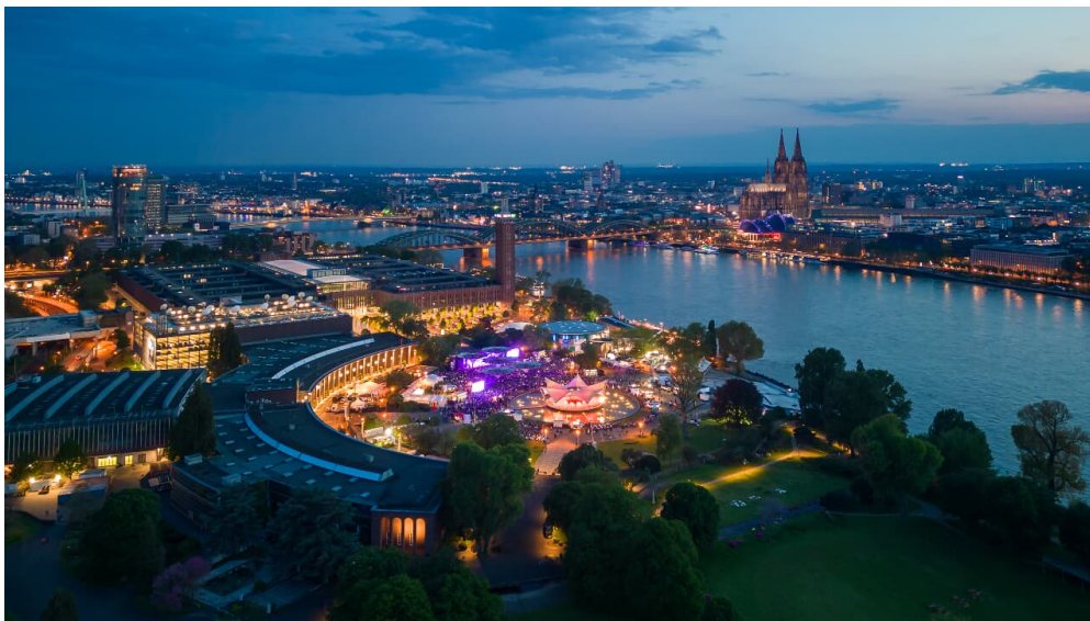
Tanzbrunnen Köln, Drohnenaufnahme bei Nacht

Cologne Bonn Airport is 14.4 km from the Tanzbrunnen and can be reached in around 17 minutes by car or in around 35 minutes by train (including the walk)