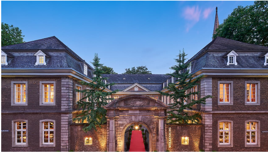
Wolkenburg Cologne Frontalansicht