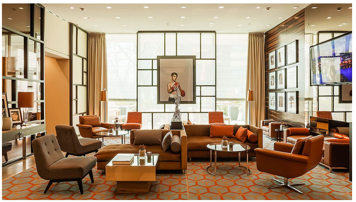
Lobby 2.jpg