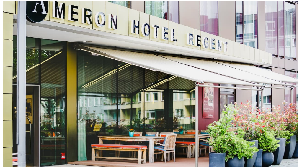
{\tt Eingang\_Terrasse.jpg}