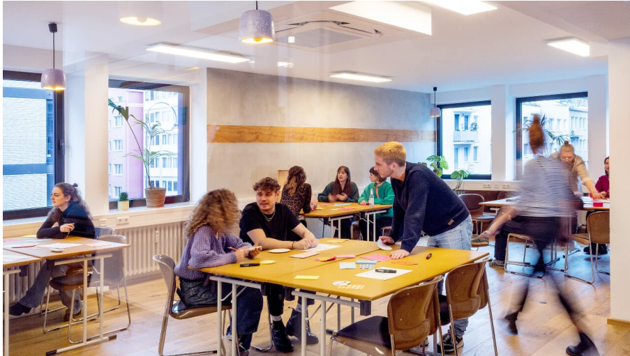
Das macht uns aus.jpg