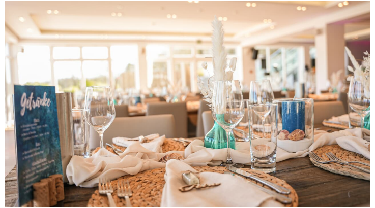
Saal Holztische I - © Kaiserschote Event Catering GmbH