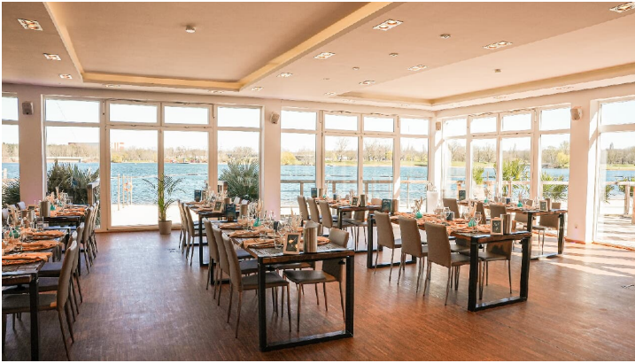
Saal Holztische