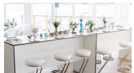
Saal gemischte Bestuhlung