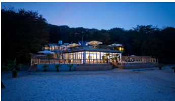
Seepavillon außen am Abend