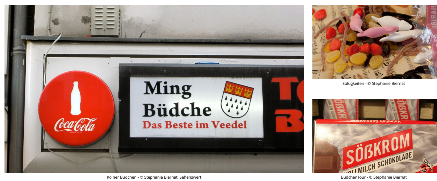
Kölner Büdchen