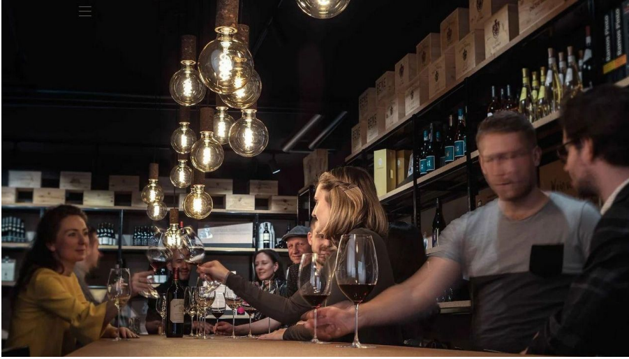
Vinotheque Hauser