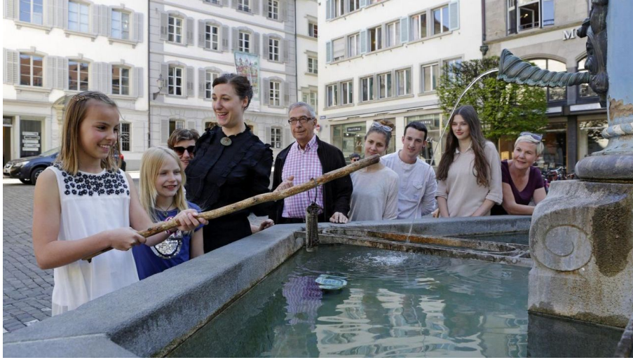
Theatrical voyage of discovery in the Belle Époque - © Luzern Tourismus