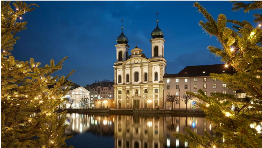
Luzern Tourismus, Beat Brechbühl