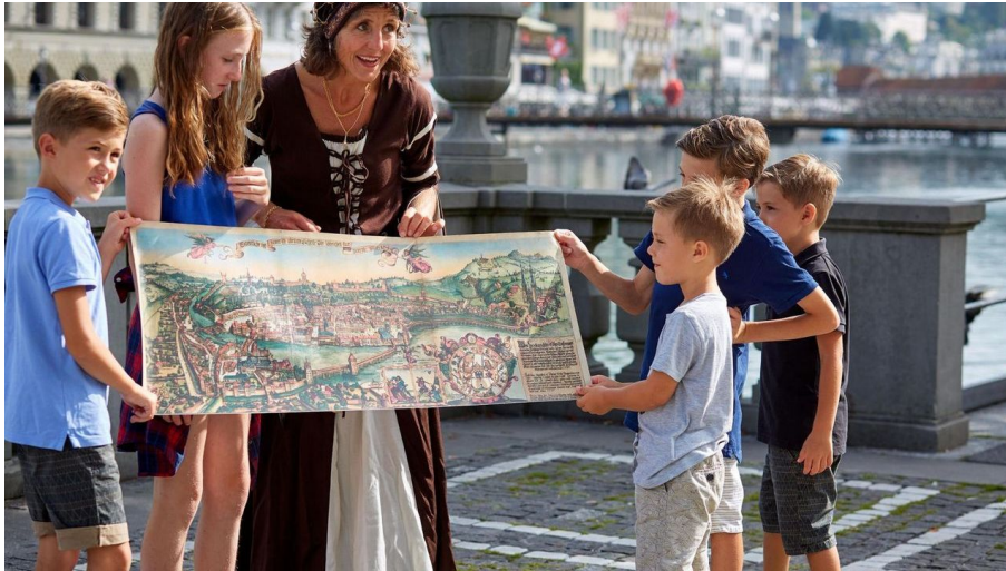
Adventure tour for children