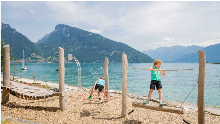
Kinderspielplatz am Ufer des Thunersees auf dem Strandweg Spiez – Faulensee