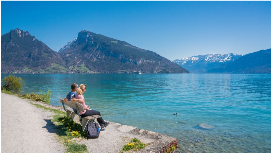
Strandweg Spiez – Faulensee Spaziergänger machen Pause und geniessen den Ausblick auf den Thunersee