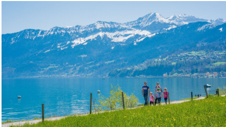
Familie unterwegs auf dem Strandweg Spiez – Faulensee im Frühling