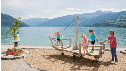
Kinder spielen auf dem Kinderspielplatz am Ufer des Thunersees auf dem Strandweg Spiez – Faulensee