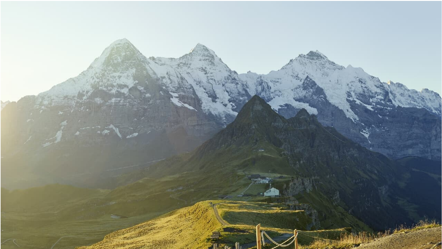
Jungfraubahnen Management AG