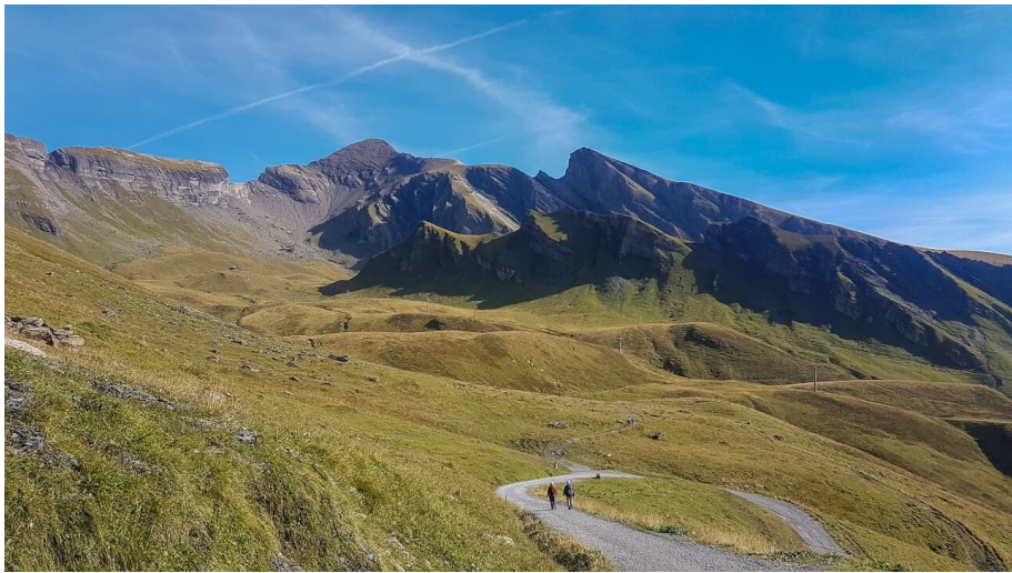
Schwarzhorn vom Distelboden aus gesehen