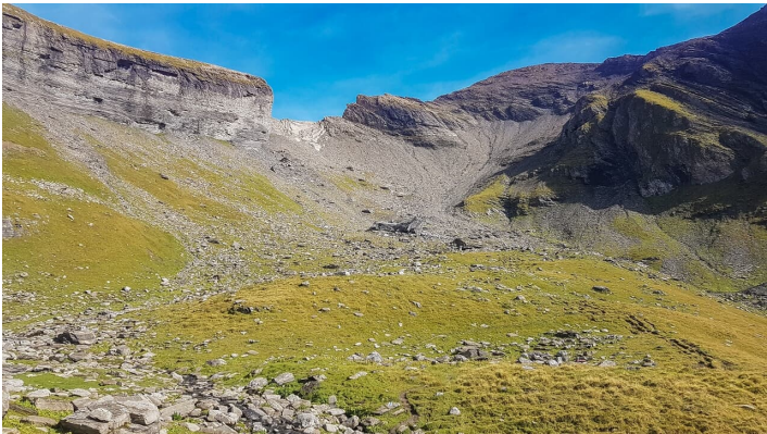
Grossi Chrinne