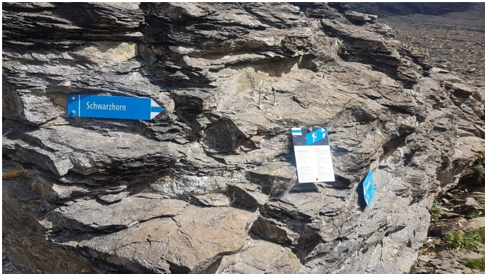
Achtung Wegweiser: Für die Wanderung rechts, für den Klettersteig (unbedingt) links abbiegen