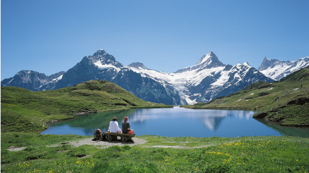
Jungfraubahnen Management AG