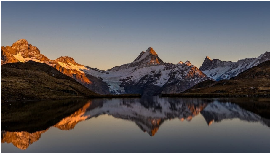
Bachalpsee im Sommer mit Wetterhorn und Schreckhorn in Abendstimmung