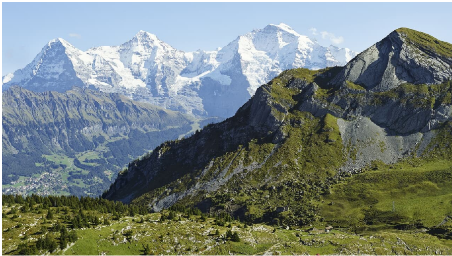
Jungfraubahnen Management AG