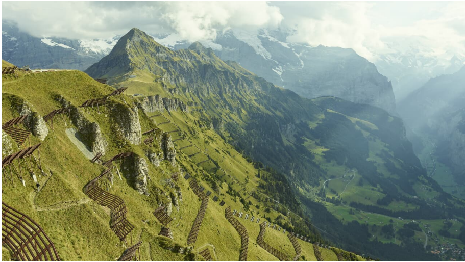
Jungfraubahnen Management AG