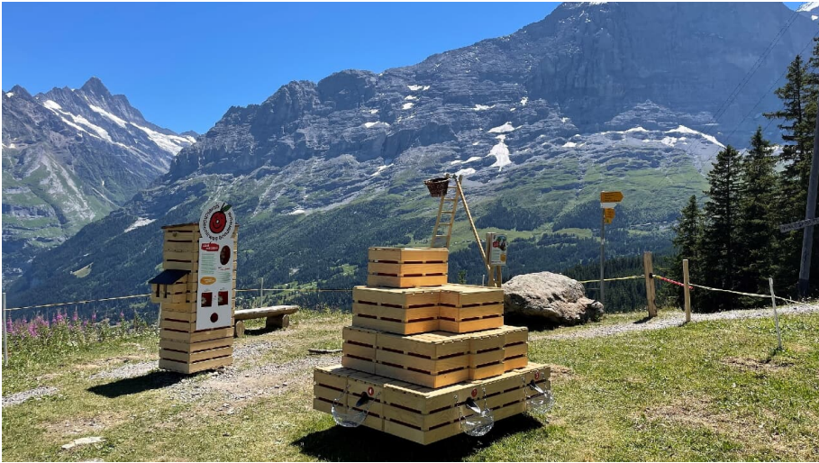
Gondelbahn Grindelwald-Männlichen AG