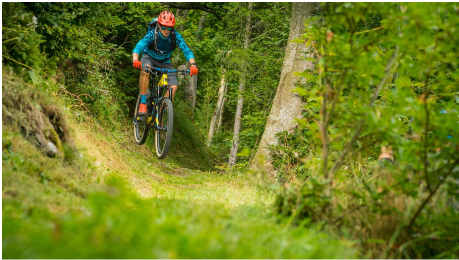
Rasante Abfahrten durch grüne Landschaften