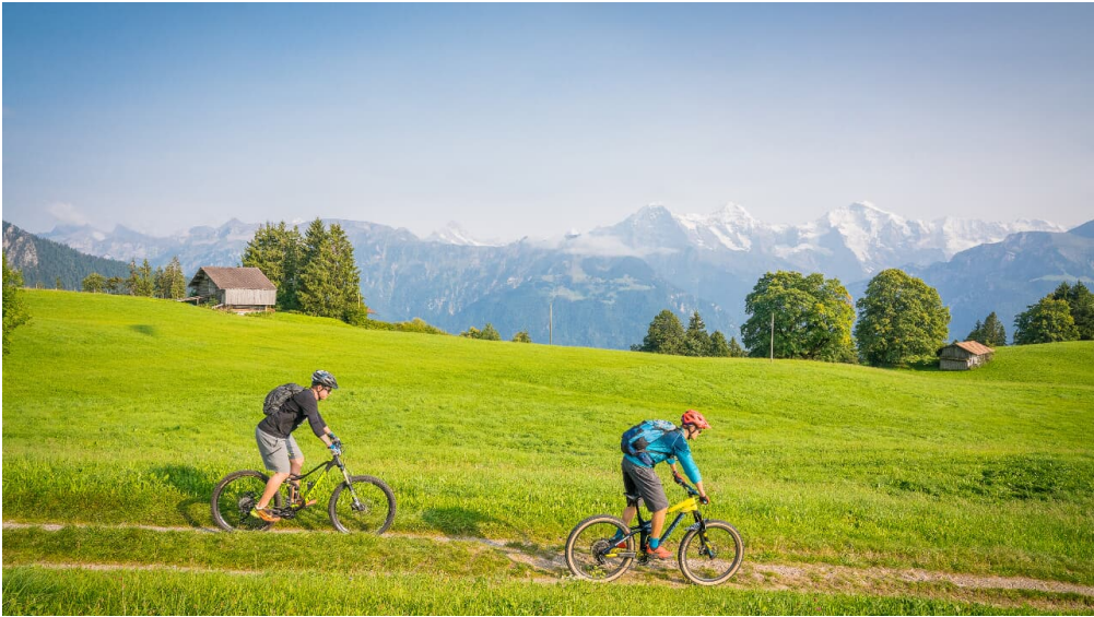
Aussichtsreiche Tour