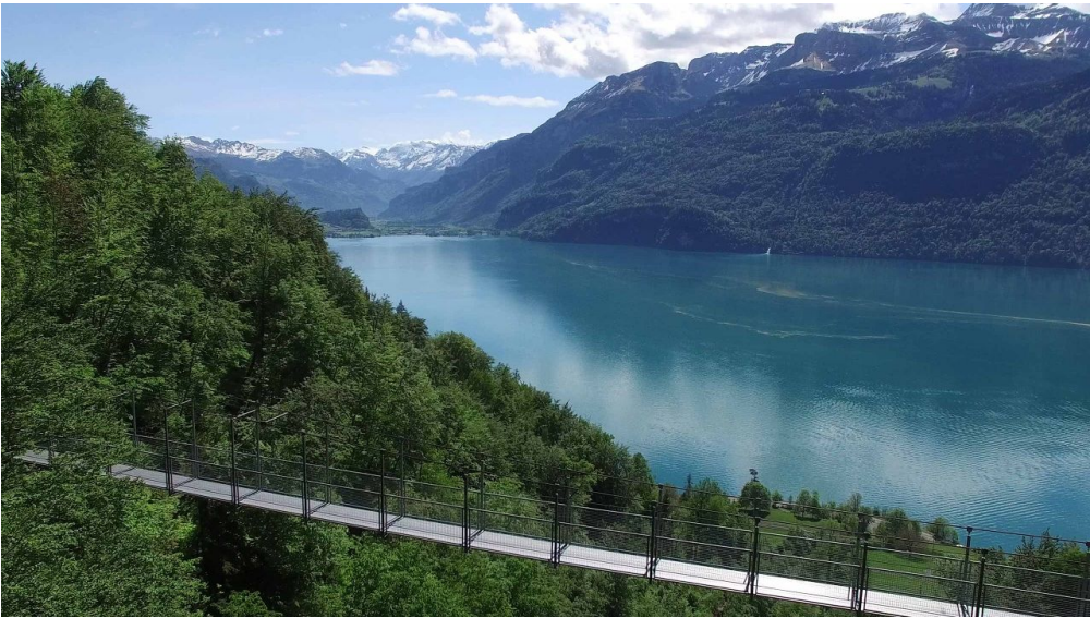
Hängebrücke Unterweidligraben ob Ebligen - Blick Richtung Brienz & Axalp - © Christian Mathyer, Interlaken Tourismus

mail@interlakentourism.ch www.interlaken.ch