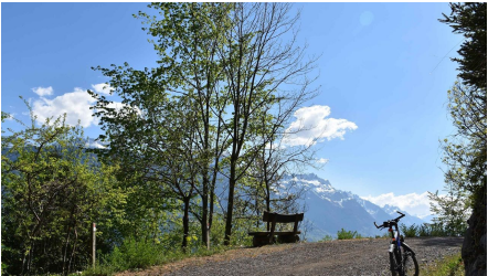
Unterwegs zur Hängebrücke Unterweidligraben - Sitzbank zwischen Brienz und der Hängebrücke - © Christian Mathyer, Interlaken Tourismus