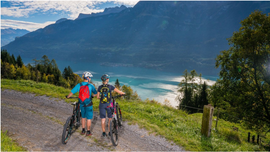
Atemberaubendes Panorama über den Brienzensee - © Interlaken Tourismus