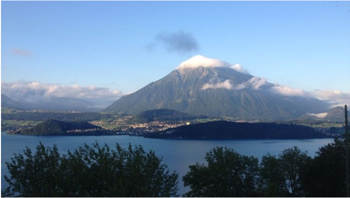
Der Hausberg Niesen