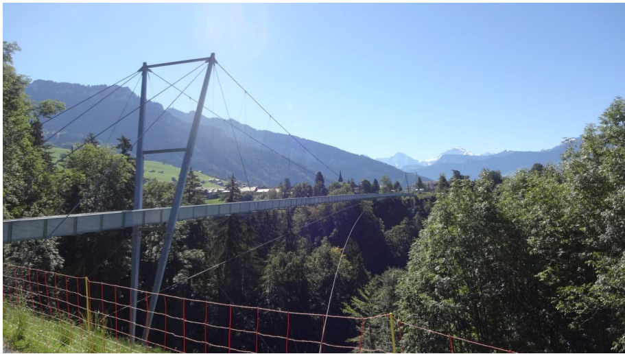
HB Sigriswil