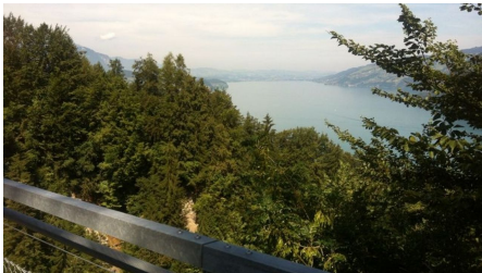
Hängebrücke Leissigen