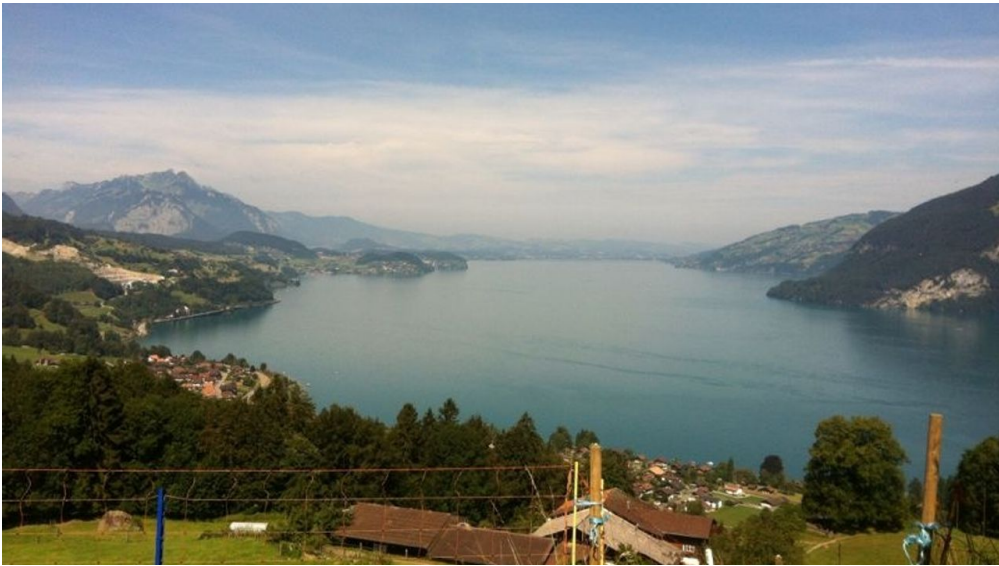
Blick auf den Thunersee von der Meilissalp