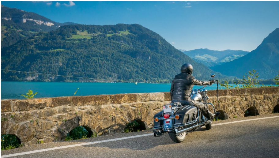
Thunersee