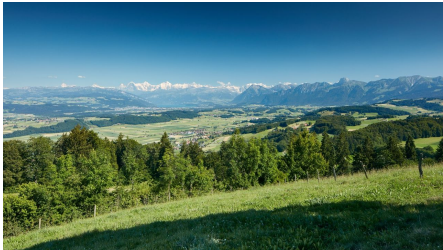
Blick von Riggisberg