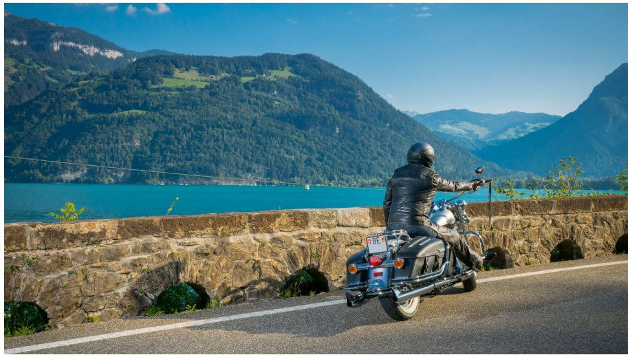
Thunersee