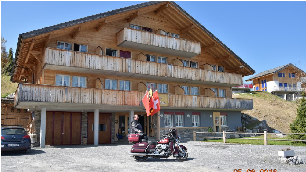
Tip Ruedi Rubi, ©Hotel Chemihüttli - © Interlaken Tourismus