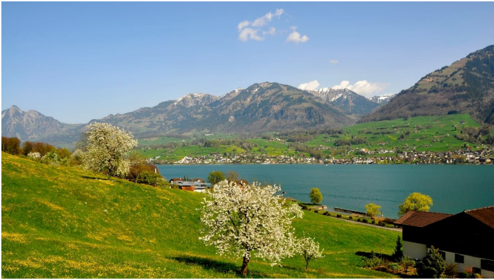
Sarnersee, ©obwalden-tourismus.ch - © Interlaken Tourismus