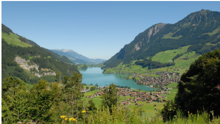
Lungern Aussichtspunkt