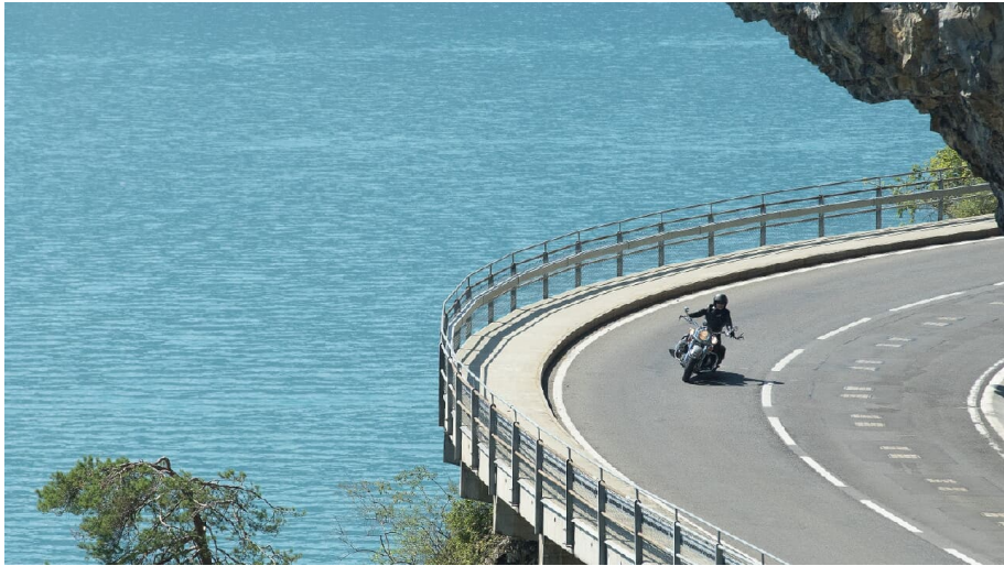
Thunersee, ©Interlaken Tourismus - © Interlaken Tourismus