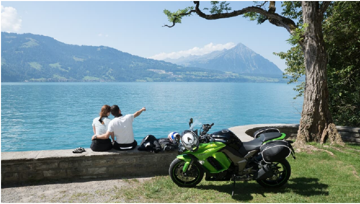
Thunersee, ©Interlaken Tourismus - © Interlaken Tourismus