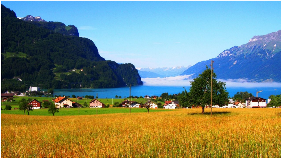
Brienzersee von Kienholz aus