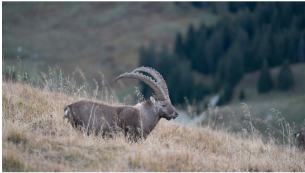
50+ Wandern - © Mike Kaufmann, Interlaken Tourismus