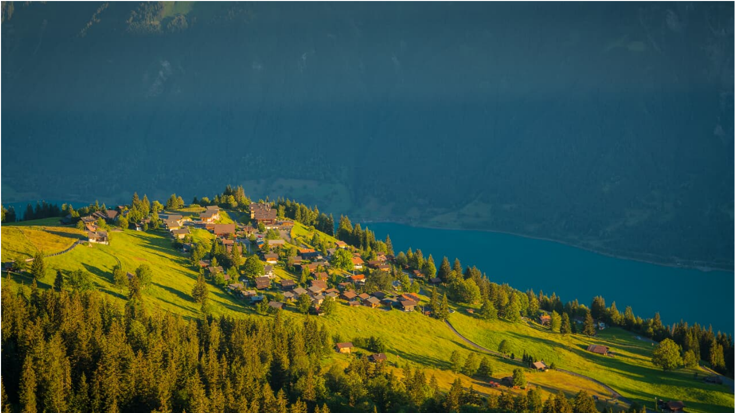
Melanie#Studer#, Interlaken Tourismus