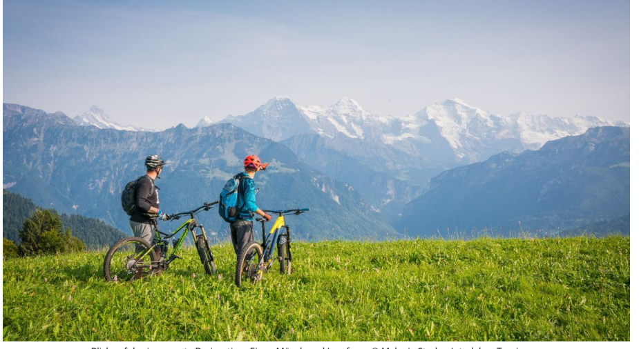
Blick auf das imposante Dreigestiern Eiger, Mönch und Jungfrau