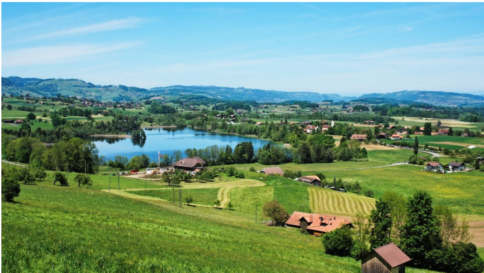
Melanie Studer, Interlaken Tourismus