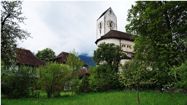
Melanie Studer, Interlaken Tourismus