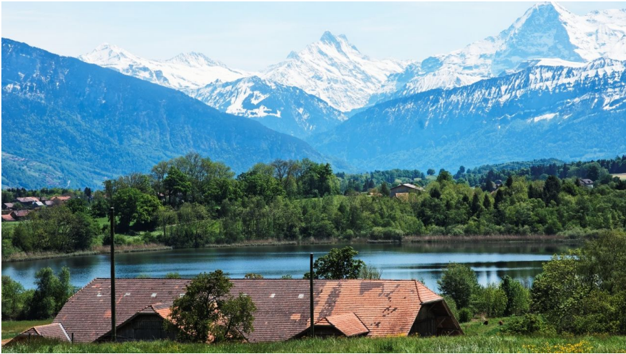
Melanie Studer, Interlaken Tourismus