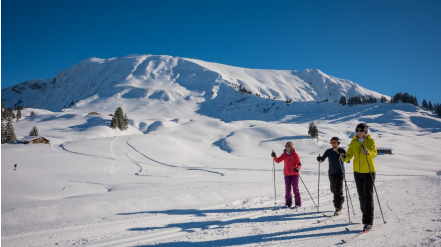
Melanie Studer, Interlaken Tourismus