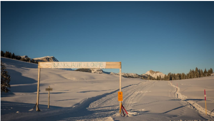
Melanie Studer, Interlaken Tourismus