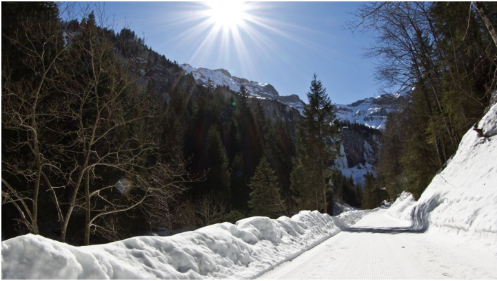
Melanie Studer, Interlaken Tourismus