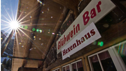
Melanie Studer, Interlaken Tourismus