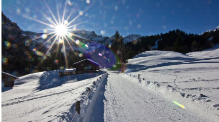
Melanie Studer, Interlaken Tourismus