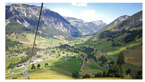
Blick von Oben auf Grimmialp und Dorf Schwenden