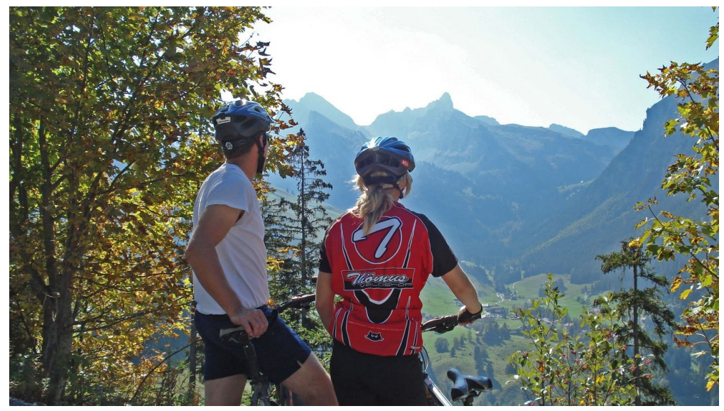
Blick auf Grimmialp und Spillgerte