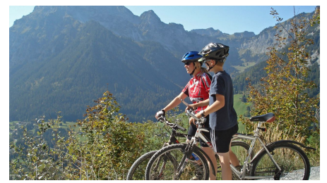
GrimmialpBike mit Seehore in Hintergrund