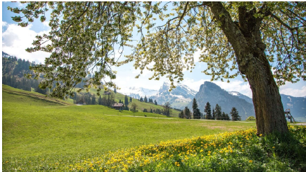
Sicht auf Wiriehorn und Schwarzenberg