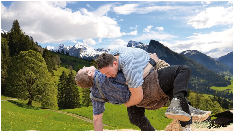
Kilian Wenger gegen Joel Wicki