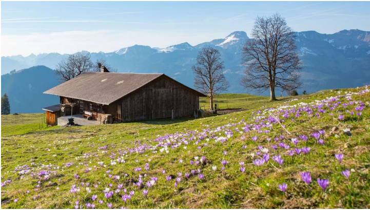
Blick ab Satteli Richtung Stockhornkette