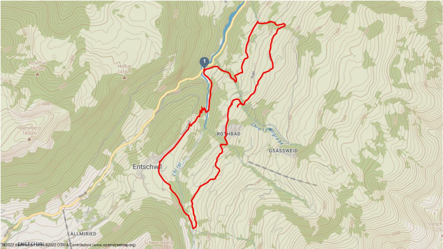
Wampflen, am Talwanderweg liegend