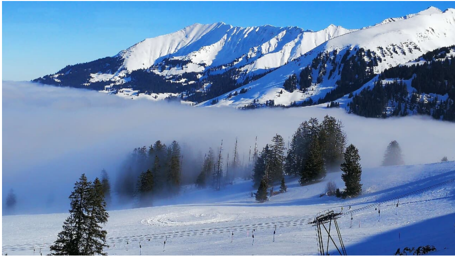
Faszinierende Weitsicht auf Niesenkette