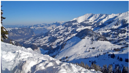
Blick ab Homad auf Start der Schneeschuhtour