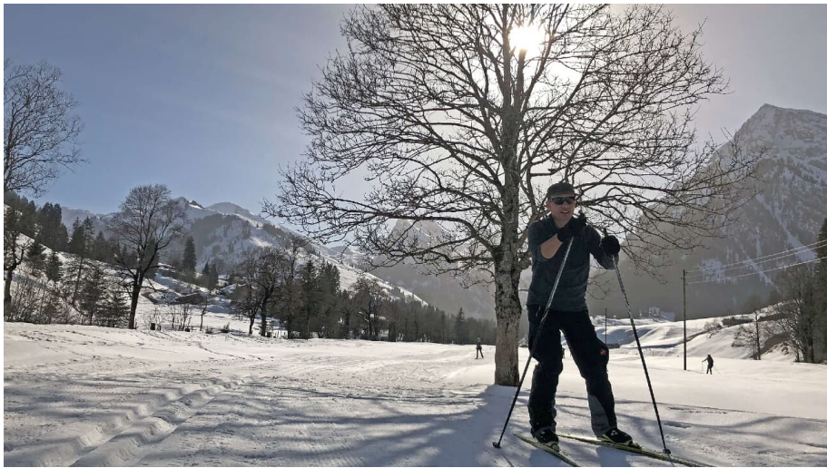
Unterwegs auf der Tiermatti Loipe