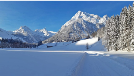
Langlaufen mit atemberaubender Aussicht - © René Burkhard, Naturpark Diemtigtal