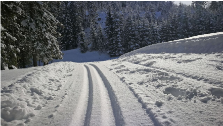
Verschneite Wälder und Weiden warten auf dich