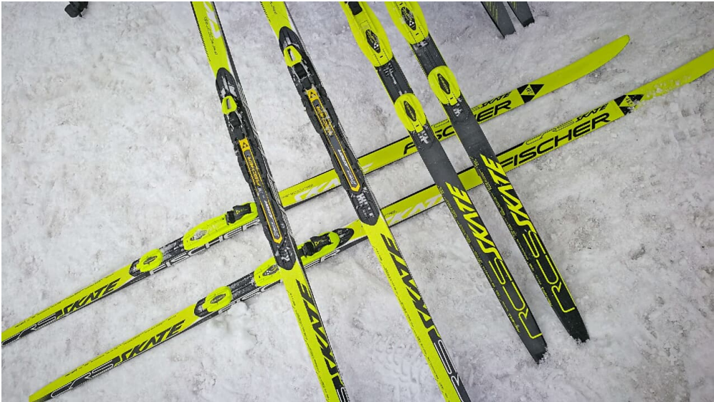
Die Langlaufskis bereit für ihren Einsatz - © Rahel Mazenauer, Naturpark Diemtigtal