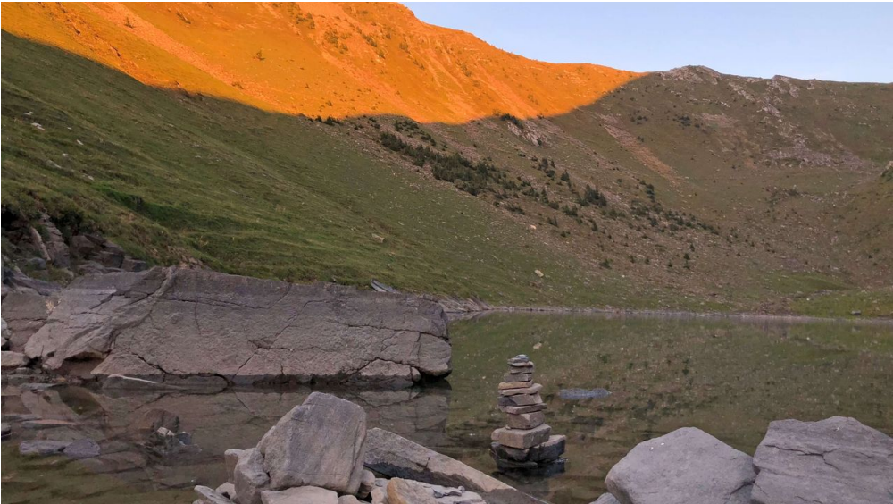
Der See hüllt sich ins Abendlicht