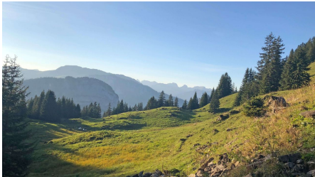
Wanderung mit Weitblick