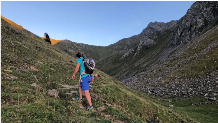
Die letzten Meter zum Meienfallseeli