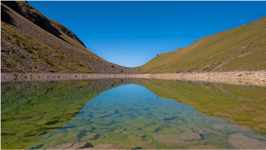
Spiegelbilder im türkisblauen See