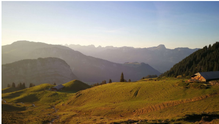
Abendstimmung auf der Alp Ober Meienfall