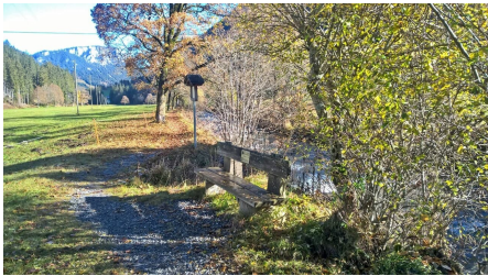
Weg über den Seeboden