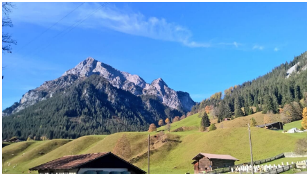
Blick auf das Seehore