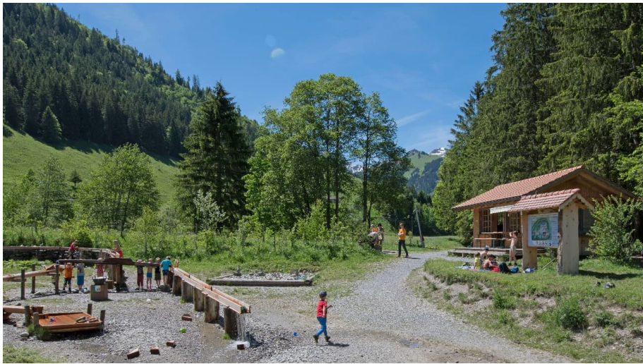
Mit Zwischenhalt beim Wasserspieplatz