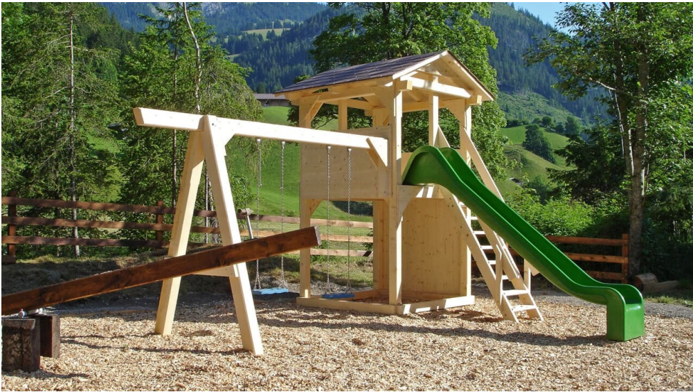
Spielplatz beim Viehschauplatz Anger