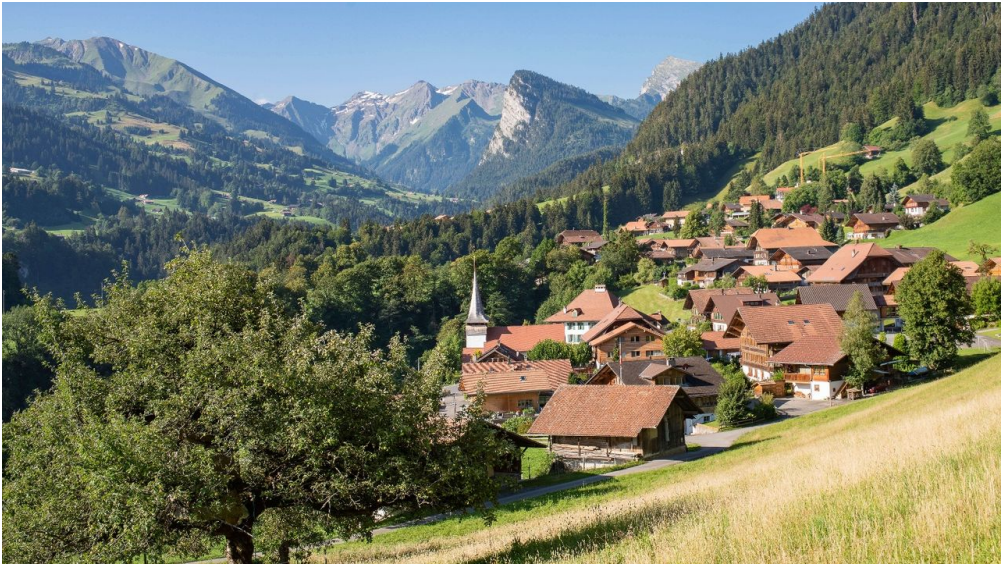
Blick auf Dorf Diemtigen