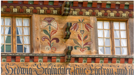
Faszinierende Hausmalerei am Sälbeze-Huus