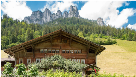
Prächtiges Beispiel beim Hinteren Riedli