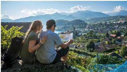
Paar liest den Flyer