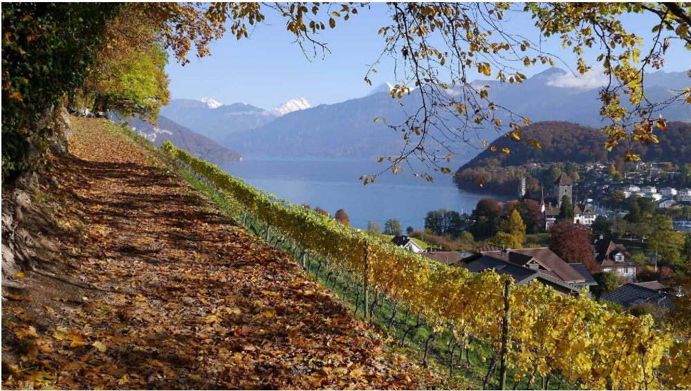
Aussicht vom Rebberg zum Schloss und auf den Thunersee