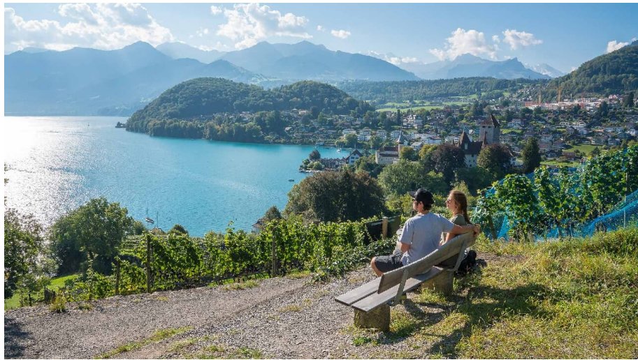
Aussichtsbänkli beim Rebberg