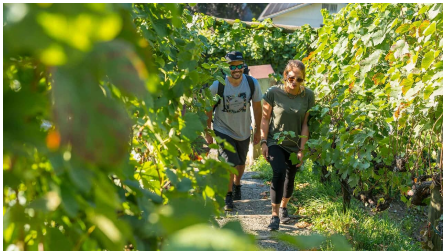
Paar geht durch die Rebassen