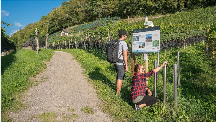
Paar liest eine Tafel