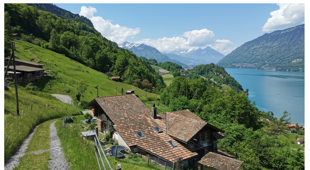
Interlaken Tourismus, Interlaken Tourismus

Here you will find details of hiking trails to inspire you in the Bernese Oberland.