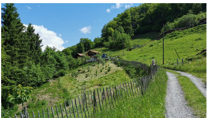
Interlaken Tourismus, Interlaken Tourismus