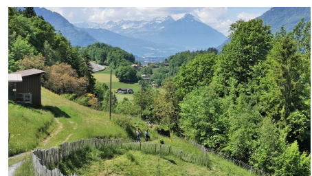
Interlaken Tourismus, Interlaken Tourismus