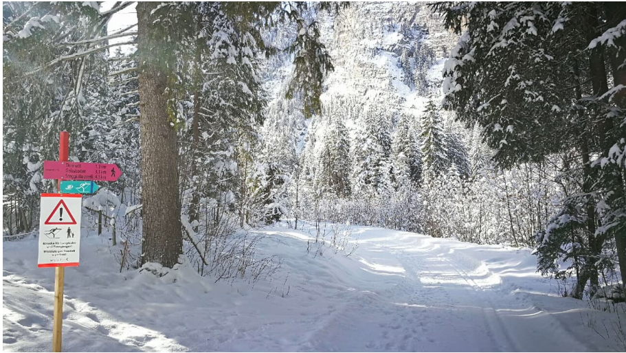
Abwechslungsreiche Wiriehorn Loipe