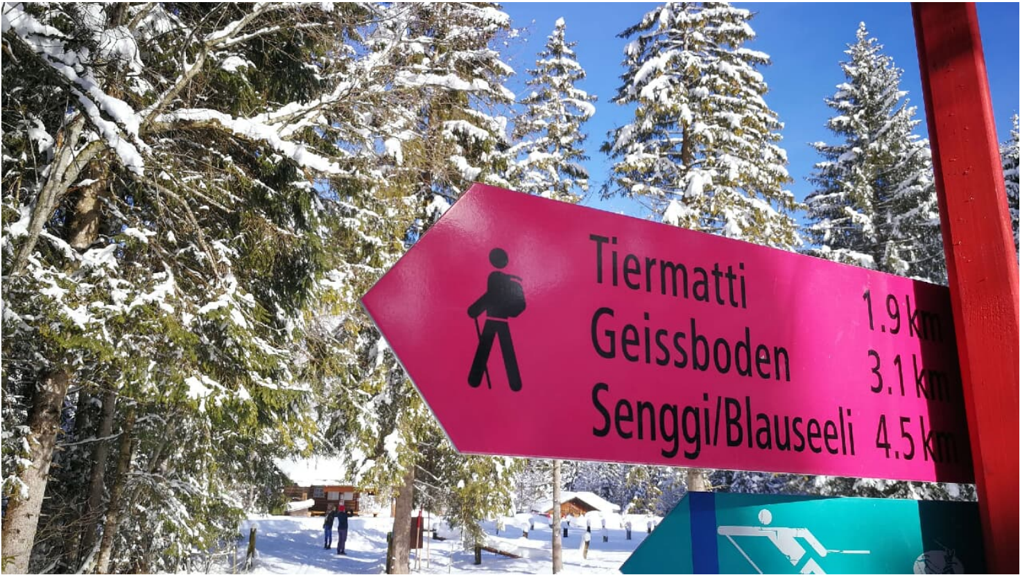
Signalisation von Loipe und Winterwanderwegen - © Rahel Mazenauer, Naturpark Diemtigtal