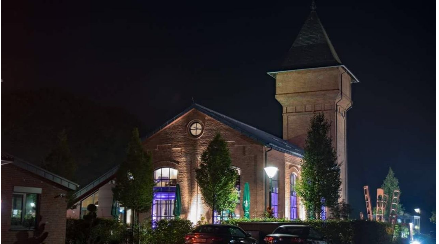
Eisenhütte bei Nacht