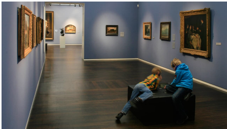
Wallraf-Richartz-Museum & Fondation Corboud