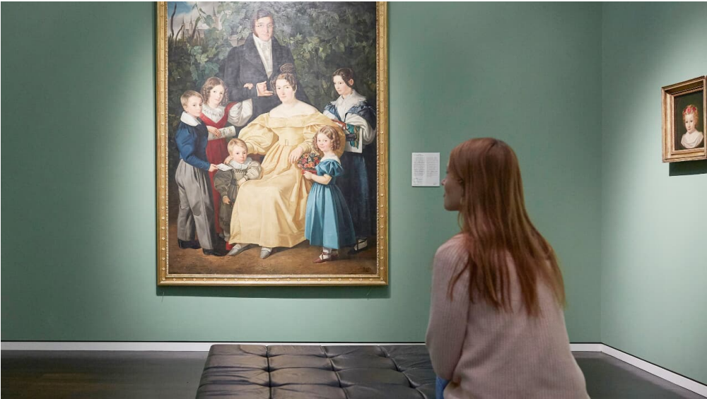
Wallraf-Richartz-Museum