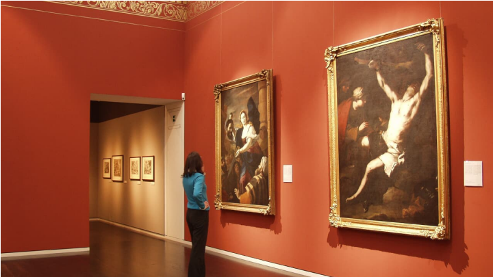
Wallraf-Richartz-Museum & Fondation Corboud